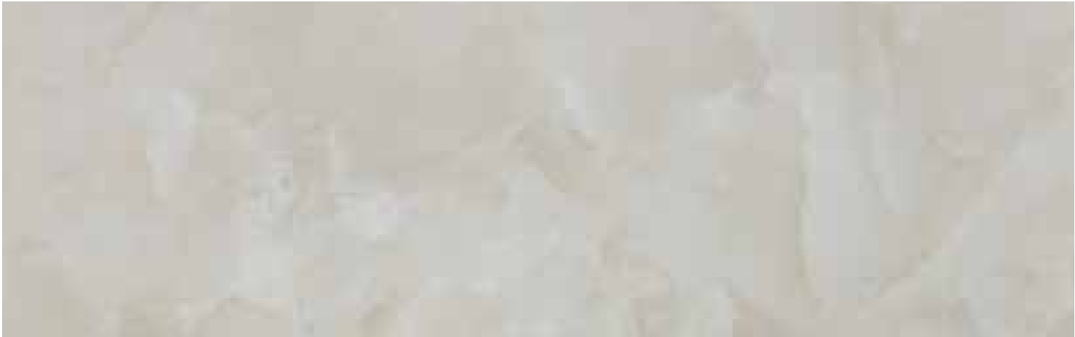
AMBROSIA VANILLA | AC: HF000840