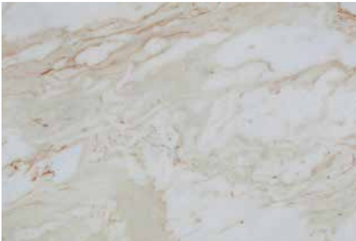
CARMEL RIPPLE | AC: HF001019