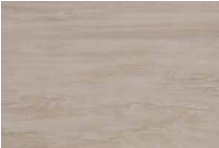
CAMBREY AKE | AC: HF001021