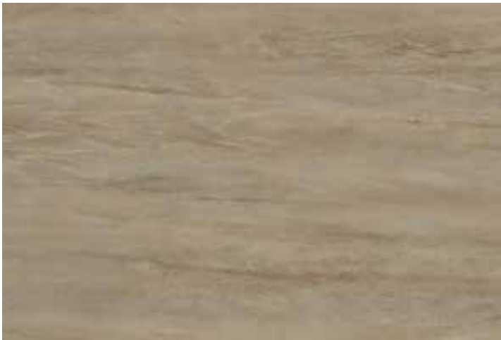
CAMBREY WHEAT | AC: HF001023