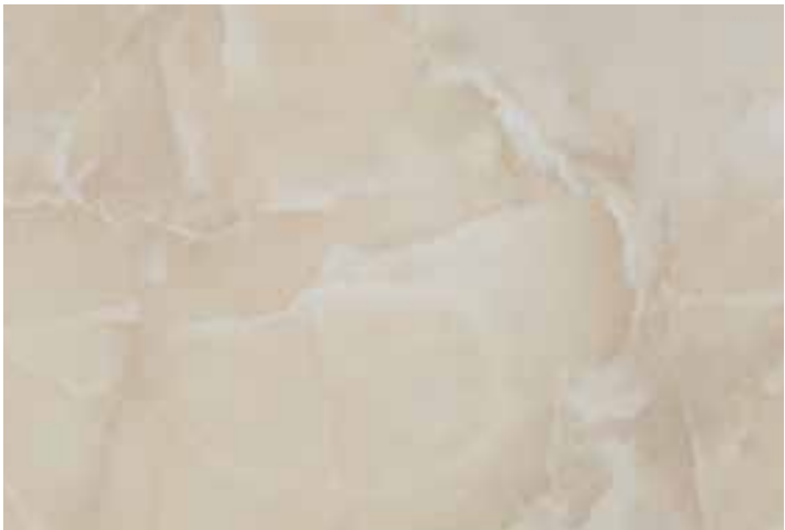
AMBROSIA CREAM | AC: HF001017