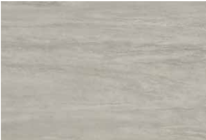
CAMBREY GREY | AC: HF000837