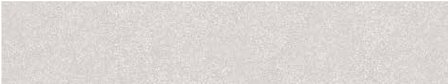
RIO CREMA DUNE | AC: HF001027