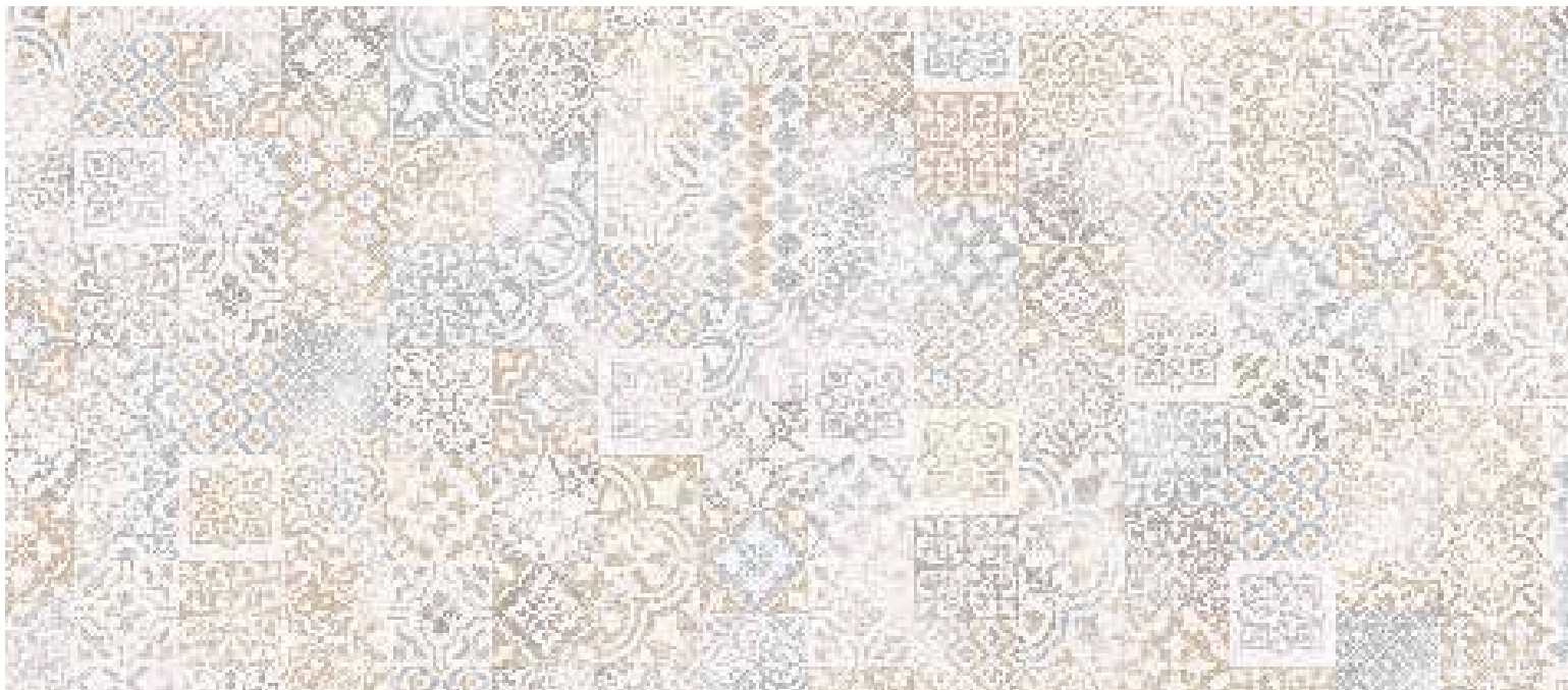
MOROCCAN ANTIQUE BEIGE | AC: HF001025