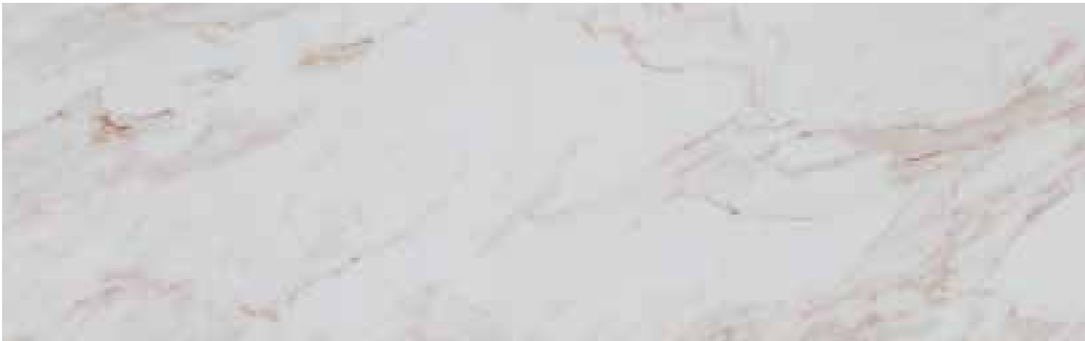
HEATH RIPPLE | AC: HF000893