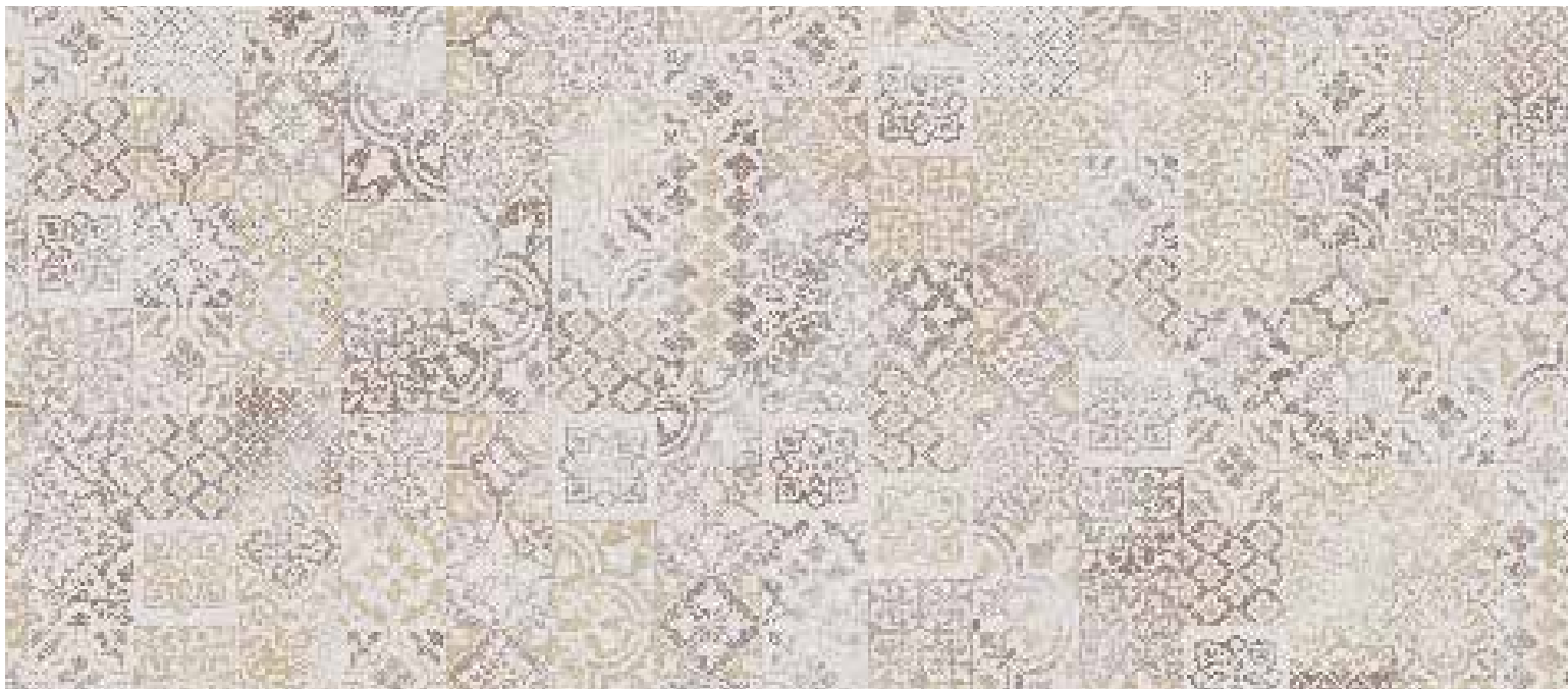
MONARCH ONTARIO GRAY | AC: HF001026