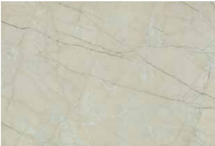
SPIDER MARBLE CREPE | AC: HF001016