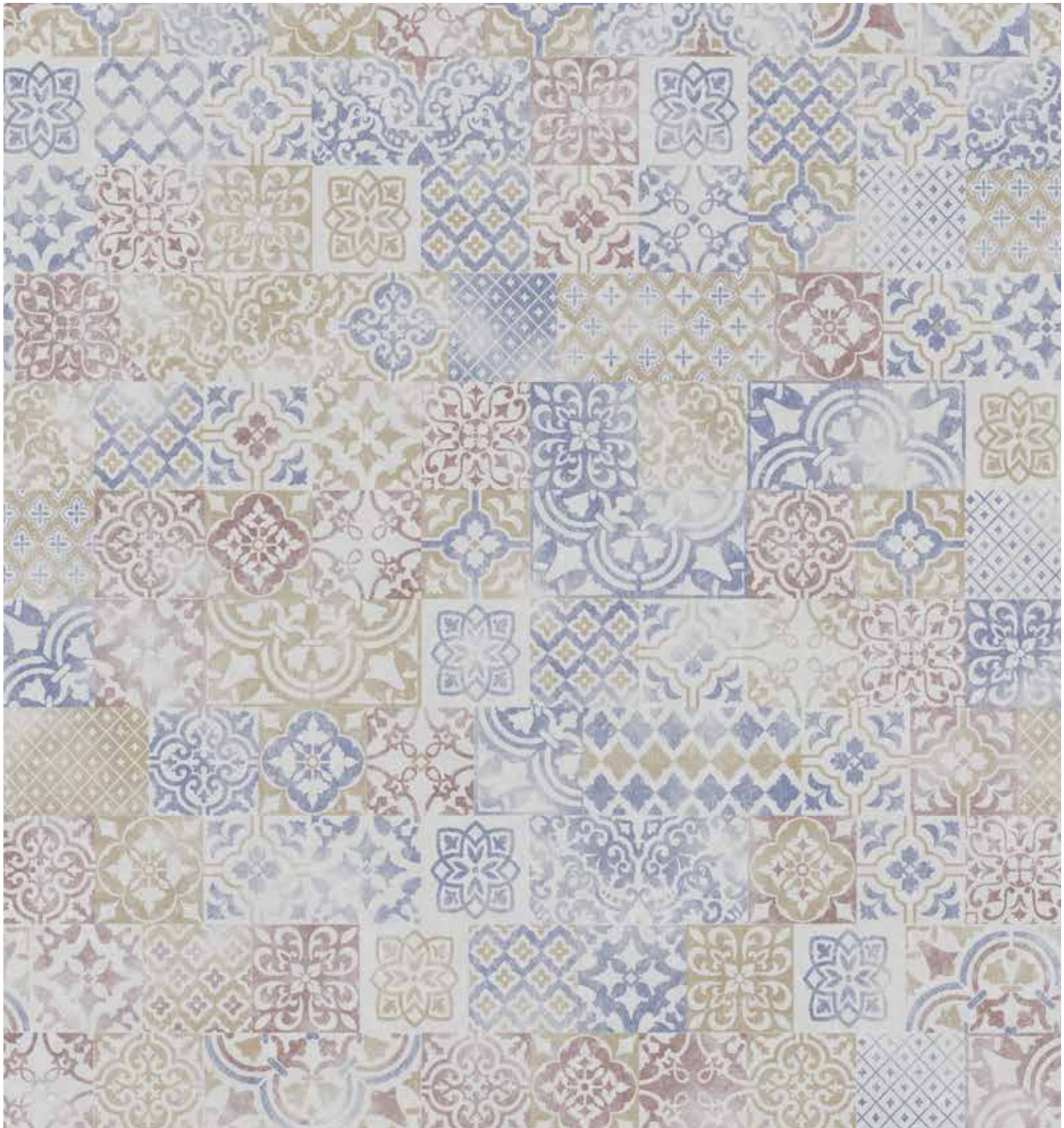
MOROCCAN CRIMSON | AC: HF001024