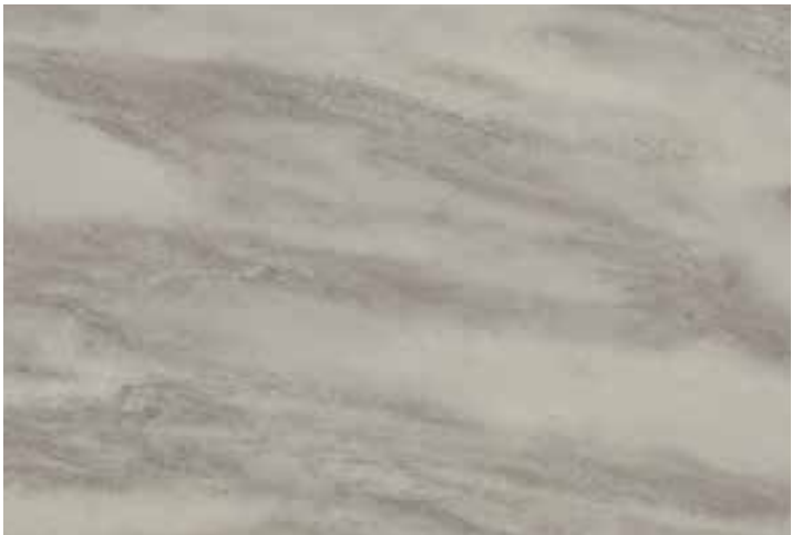
MINEROLOGY SHADOW | AC: HF001015