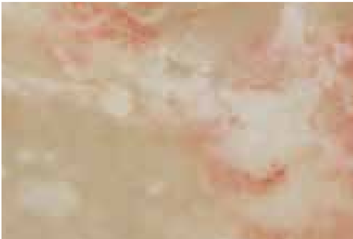
SUNATO | AC: HF001018