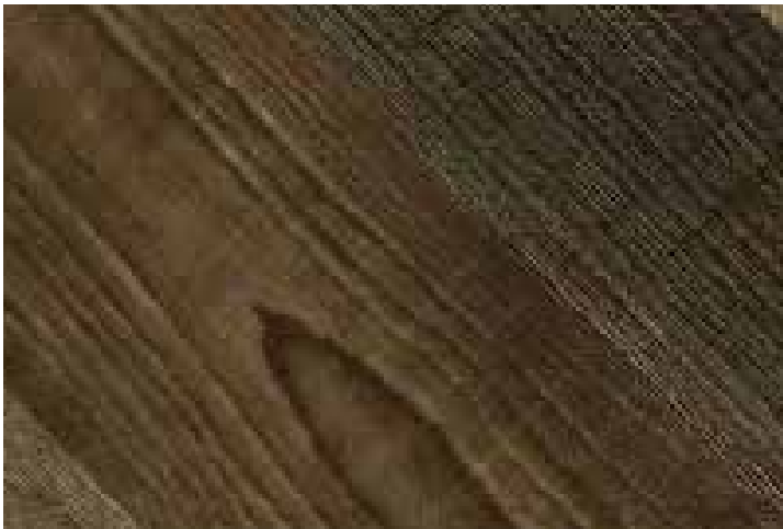
TIPPECANOE BLACKWATER | AC: HF000847