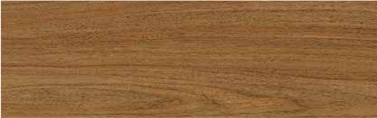
ALMOND | AC: HF000823