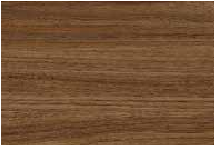
DARK WALNUT | AC: HF000824