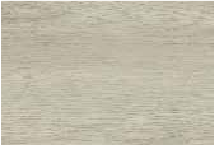
SHAKER OAK | AC: HF000812