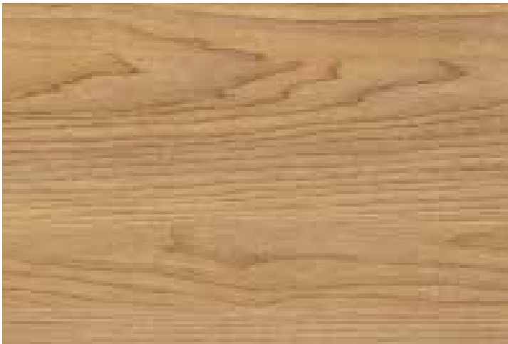
WOOD LAND OAK | AC: HF000820