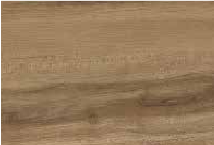
SERENITY SUNFLOWER | AC: HF000843