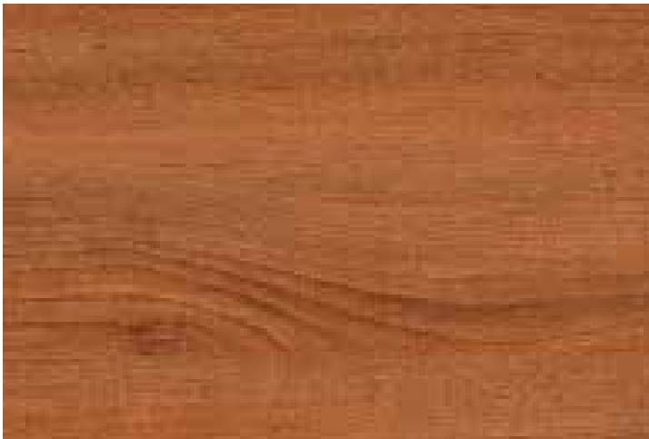
NATURAL TEAK | AC: HF000822