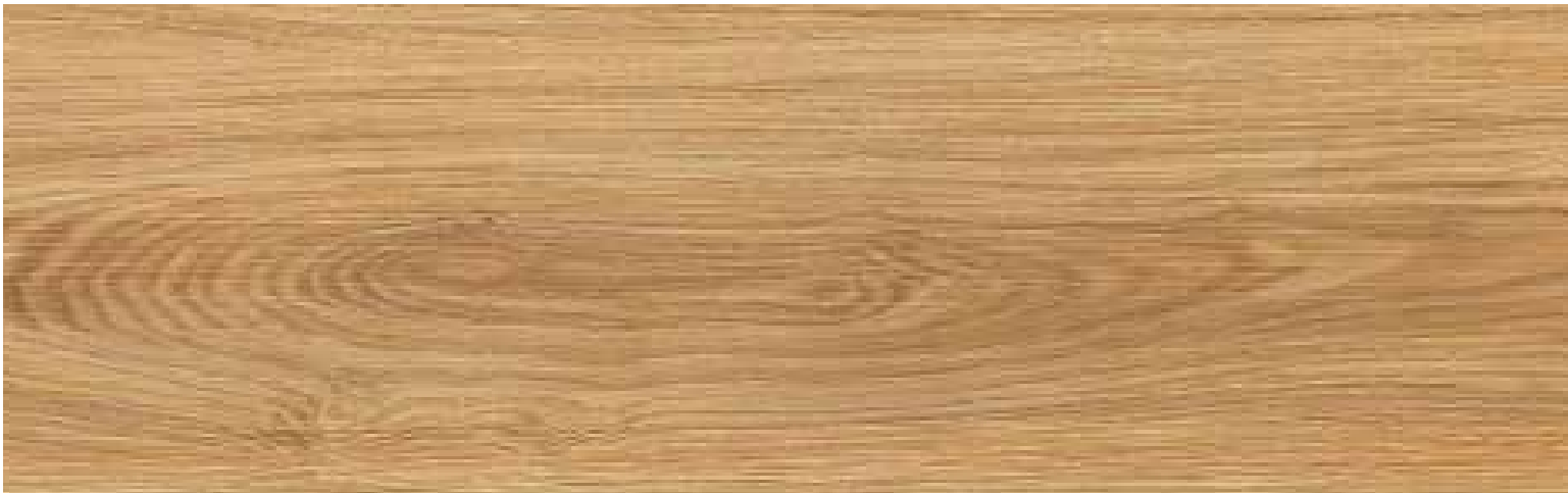
WHISKER OAK | AC: HF000552