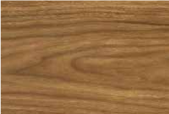
HEARTWOOD | AC: HF000851