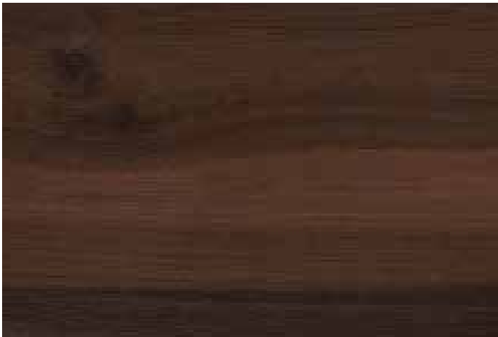
TAWNY HICKORY | AC: HF000850