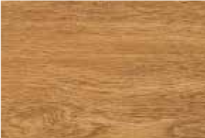
COPPER OAK | AC: HF000807