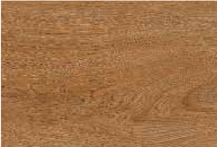
TEAK BROWN | AC: HF000821