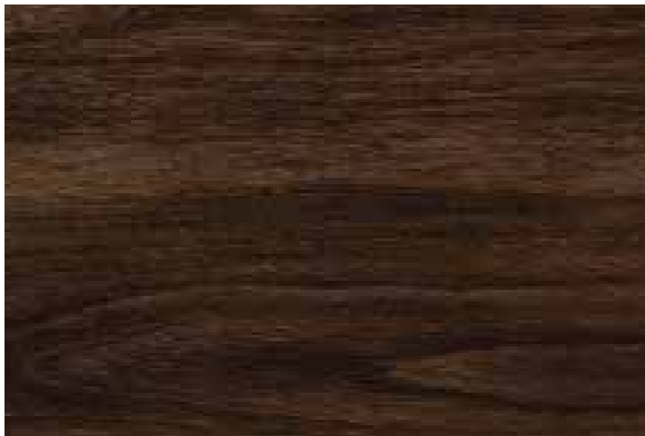
JAVA WOOD | AC: HF000551