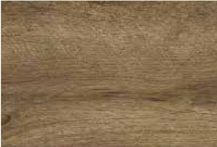
COWBOY OAK | AC: HF000842