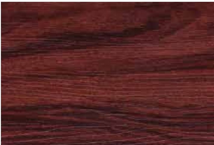
CAROLINA CHERRY | AC: HF000553