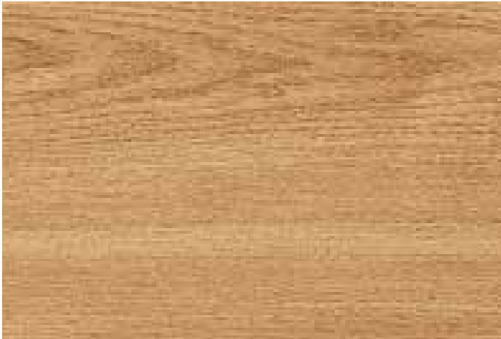
GOLDEN OAK | AC: HF000819