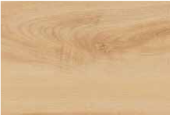
SERENITY PEACH | AC: HF000844