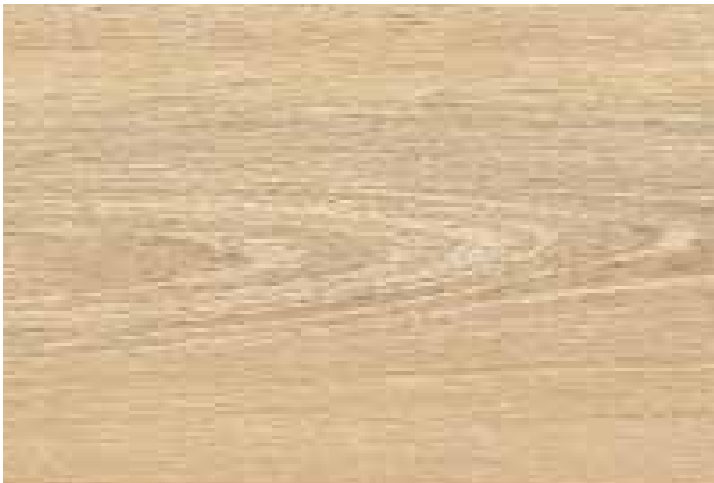
LIGHT OAK | AC: HF000817