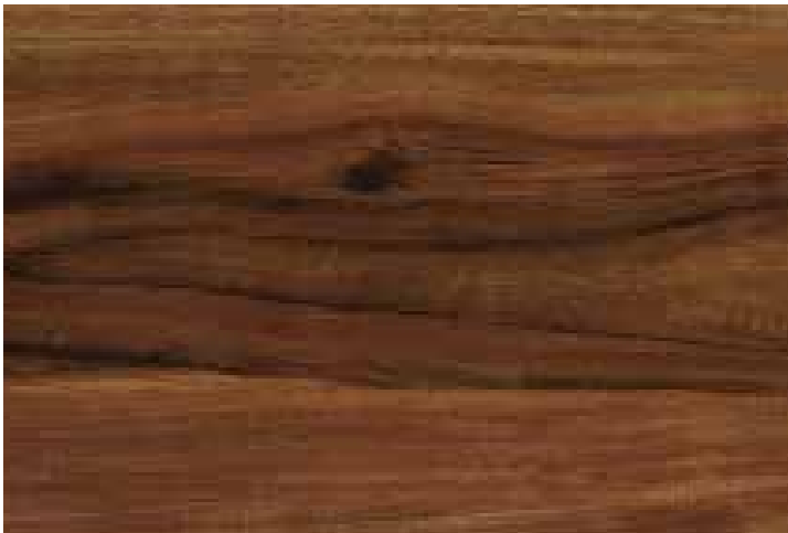
ROSID | AC: HF000550