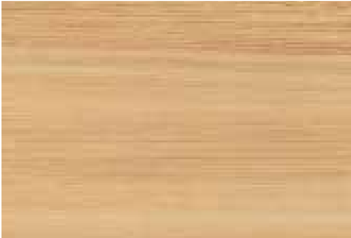
HARVEST HARMONY | AC: HF000808