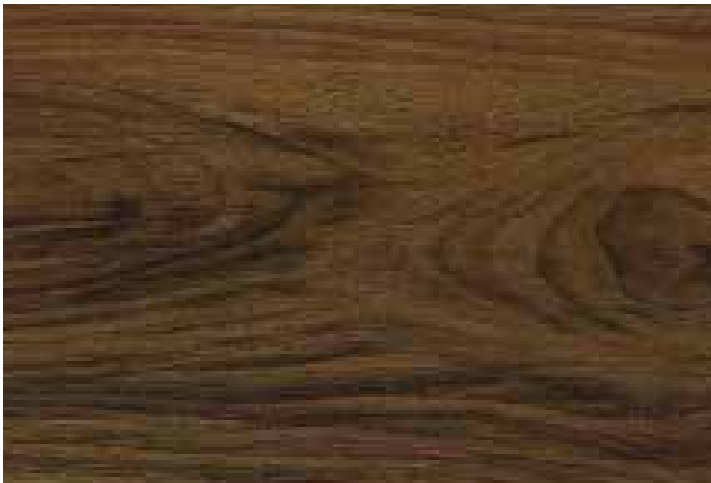
LUISIANN LAUREL | AC: HF000554