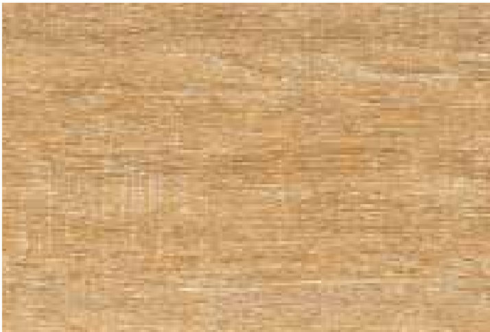
NATURAL OAK | AC: HF000818