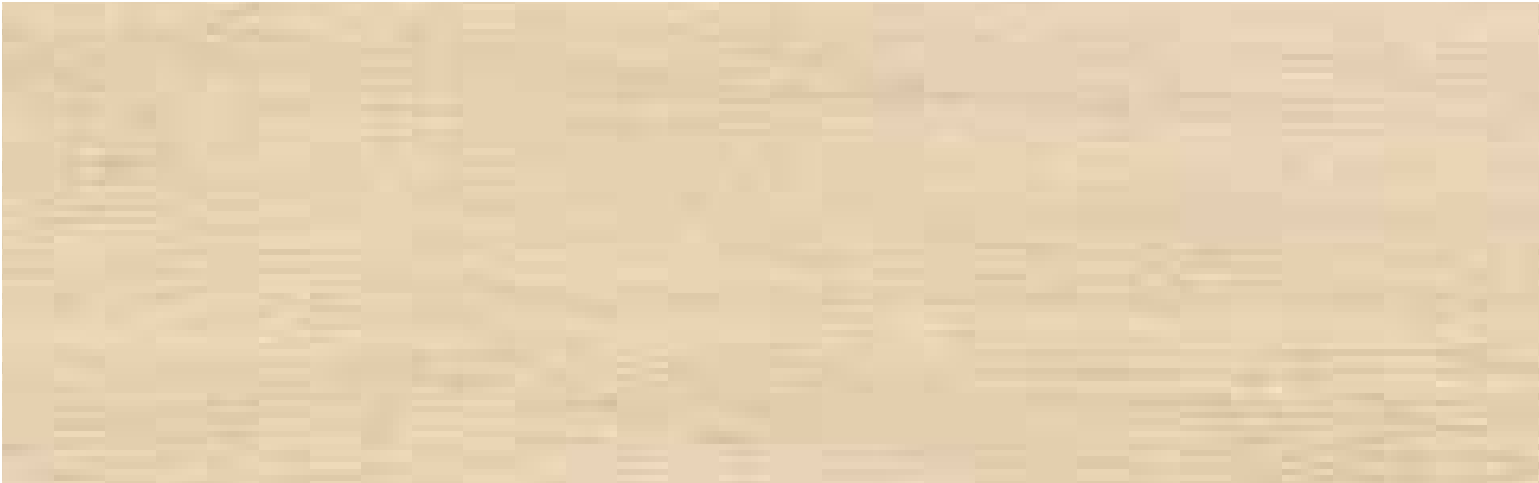
COASTAL SAND OAK | AC: HF000809